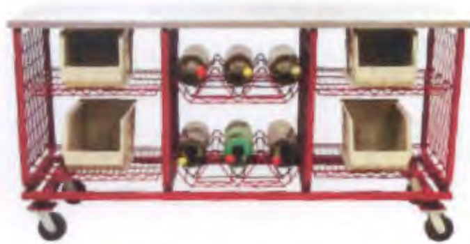
Model #WT-3W2424 shown with optional accessories. Standard unit ships with 4 HBS-2424 and 2 VS-2424 Shelves.