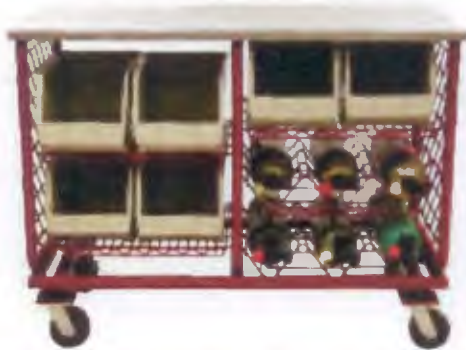
Model #WT-2W2424 shown with optional accessories. Standard unit ships with 2 HBS-2424 and 2 VS-2424 Shelves.

Mobile Worktable features an industrial stainless steel top, durable powder coated steel frame and adjustable shelving to provide years of service. It is available as a two compartment model measuring 52.5" long X 25" deep X 39.5" tall, or as a three compartment model measuring 77" long X 25" deep X 39.5" tall. The Worktables are mounted on four heavy-duty swivel casters (two locking) for ease of movement around the station. The Worktable can be ordered with quick change flat shelving (two per compartment), or with V shelves for SCBA bottles. Additionally, flat shelves can accommodate two convenient storage bins each.