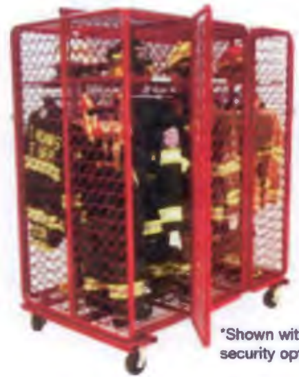
*Shown with security option